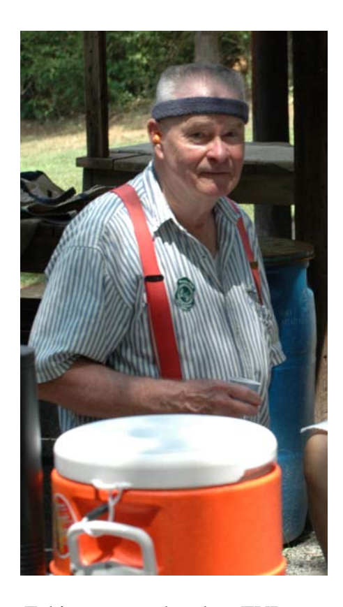
Taking a water break at TVD.