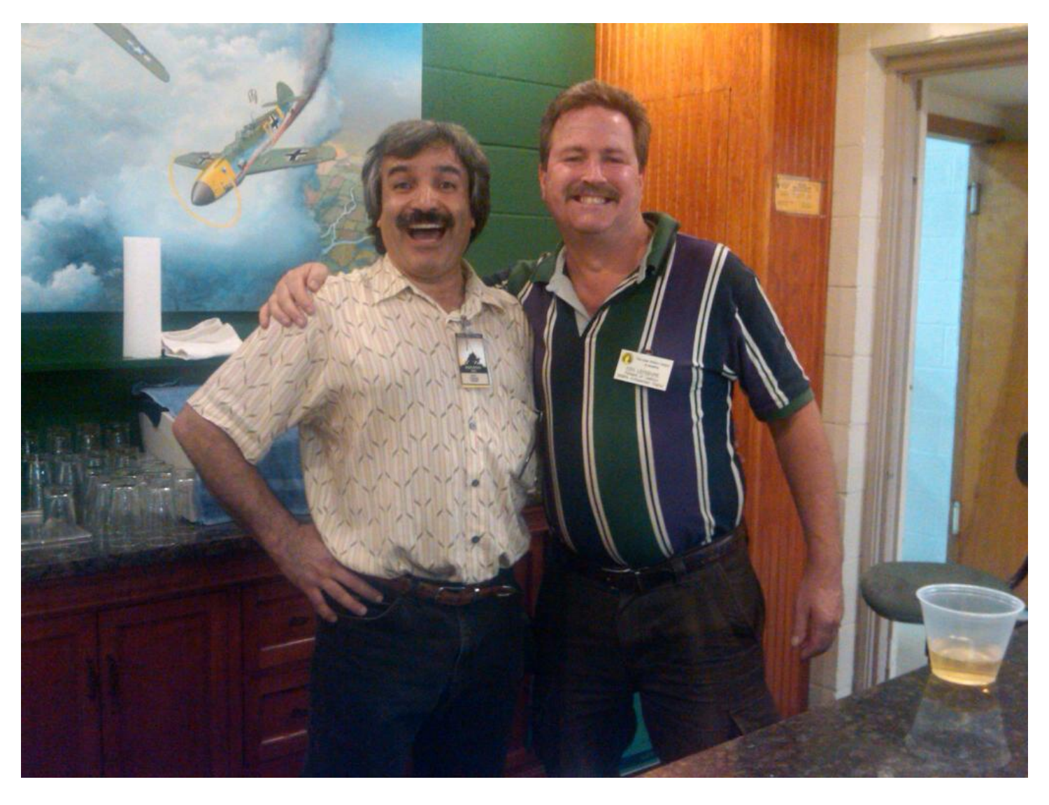
Why do you come to the IWLA-WAC? Because, even on your very worst day, a smile emerges-just like the ones on these two chaps-and, it ends up being "The Best Day Ever!"