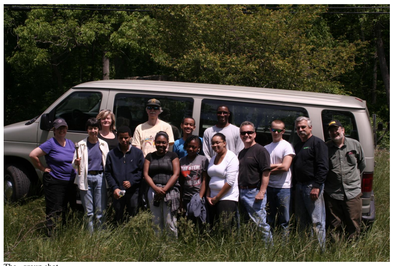
The group shot