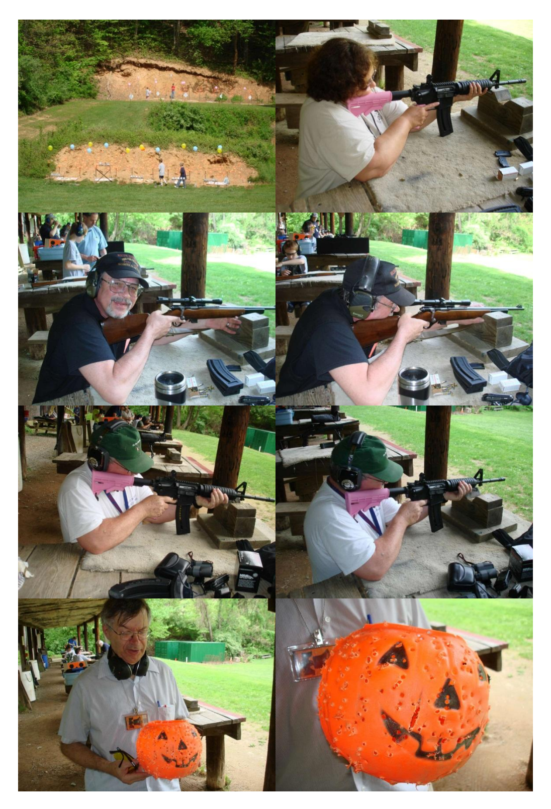
This Pumpkin took a lickin' and kept on tickin'....