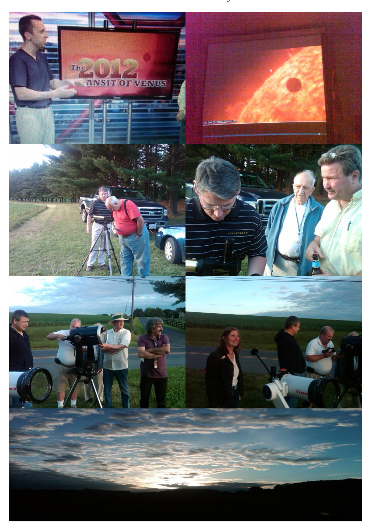
Lost our Solar Telescopic View...