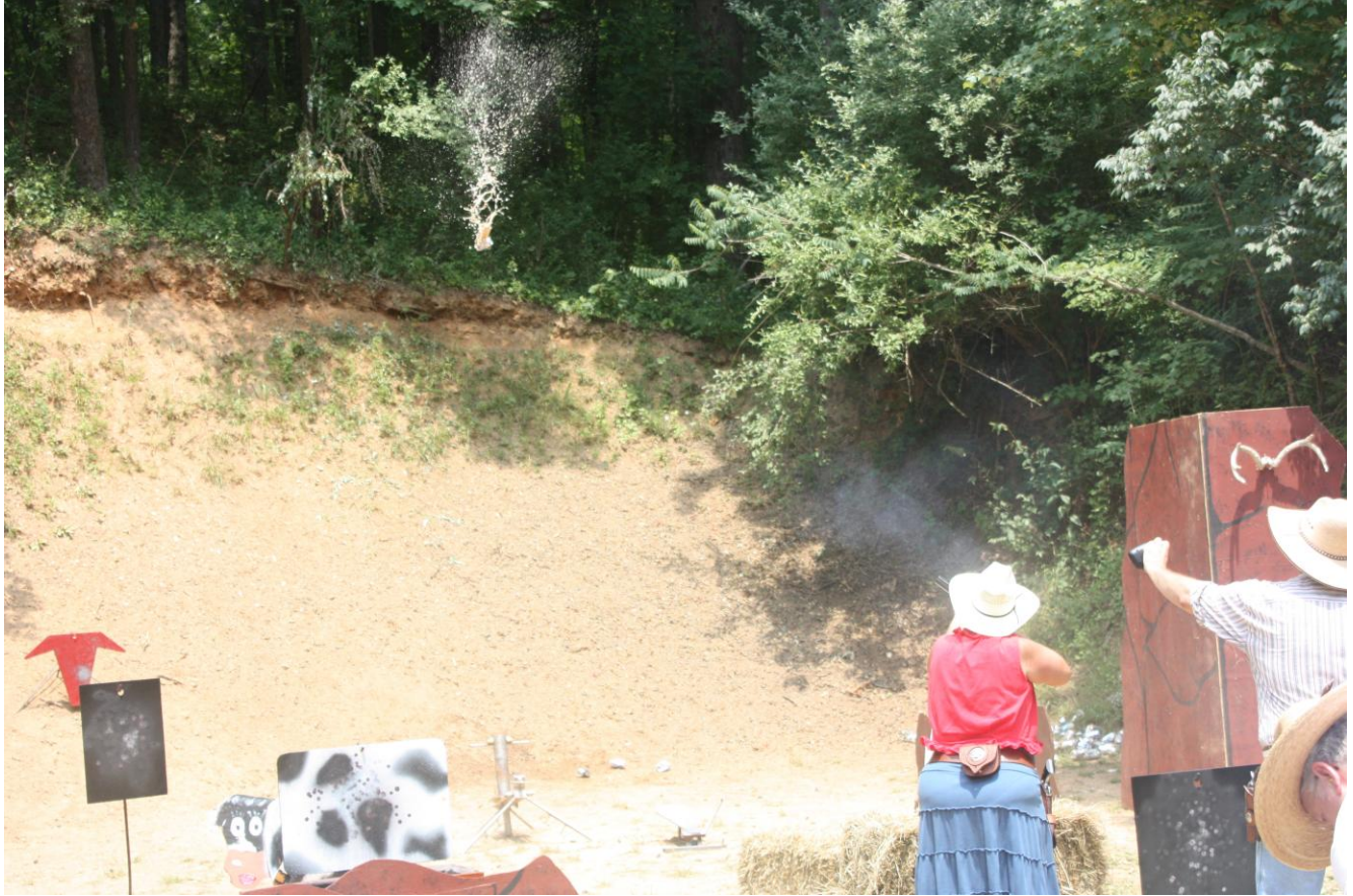
Soda can gets blasted by a scattergun!