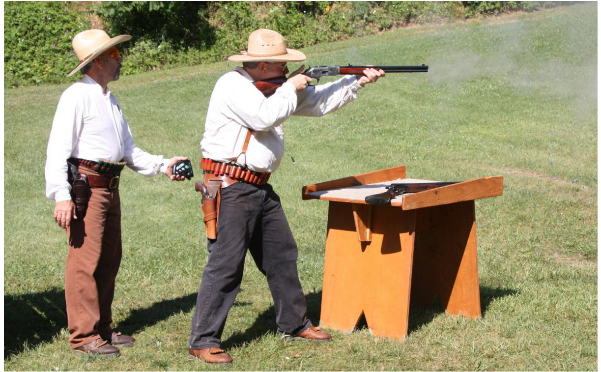
Our chapter's treasurer, "Dogmeat Dad" - Shooting his black powder rifle with "Tug Hill" timing.