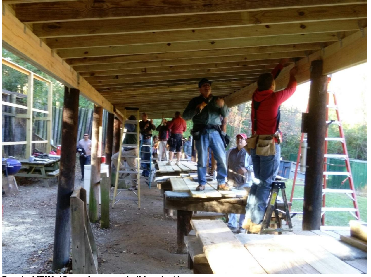
Day 1 - NEW rifle roof structure build-up in 6 hours. Day 2.-Sound proofing installation. Day 3- clean-up and Rifle range is back in service!