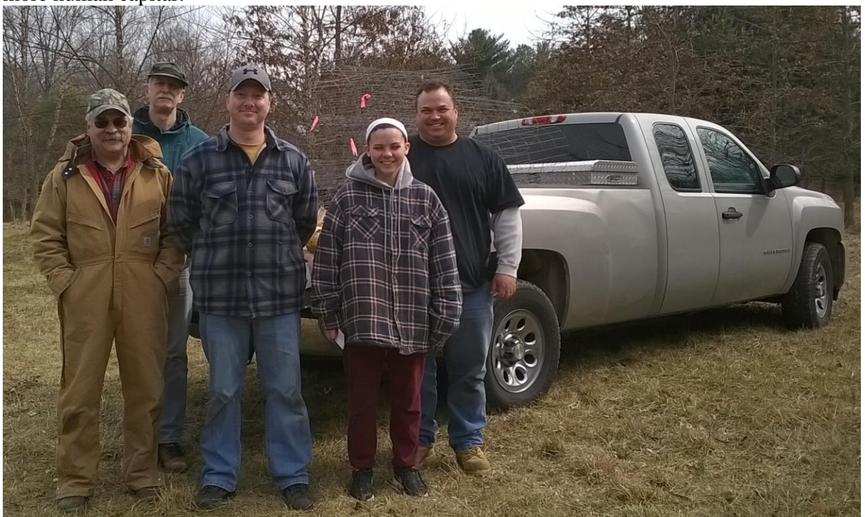
The small but effective group at Pigtail on March 5, 2016 (Meo Curtis participated as well)