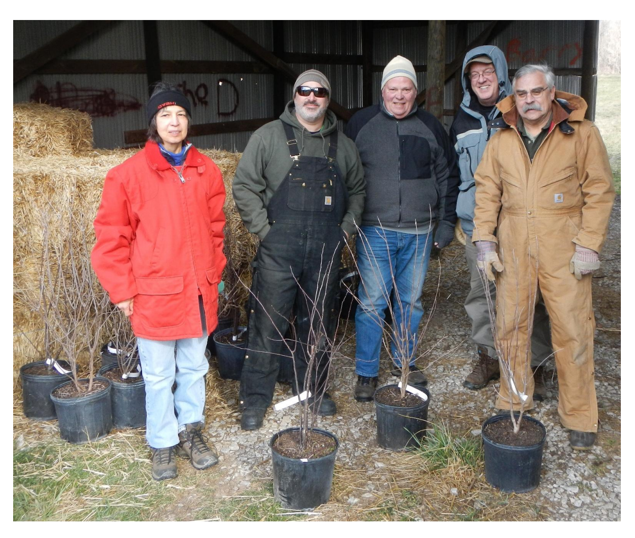
The Pigtail group on March 11<sup>th</sup>