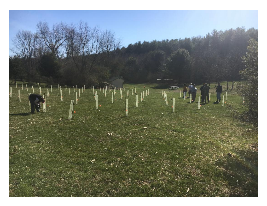
Christmas trees planted and tubed