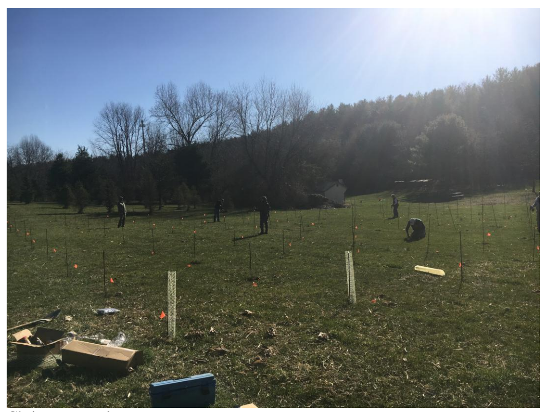
Christmas tree layout

Montgomery County: Year-round at the Shady Grove Transfer Station. <a href="https://www2.montgomerycountymd.gov/DepHowDoI/material.aspx?tag=household-hazardous-waste&key=157">https://www2.montgomerycountymd.gov/DepHowDoI/material.aspx?tag=household-hazardous-waste&key=157</a>