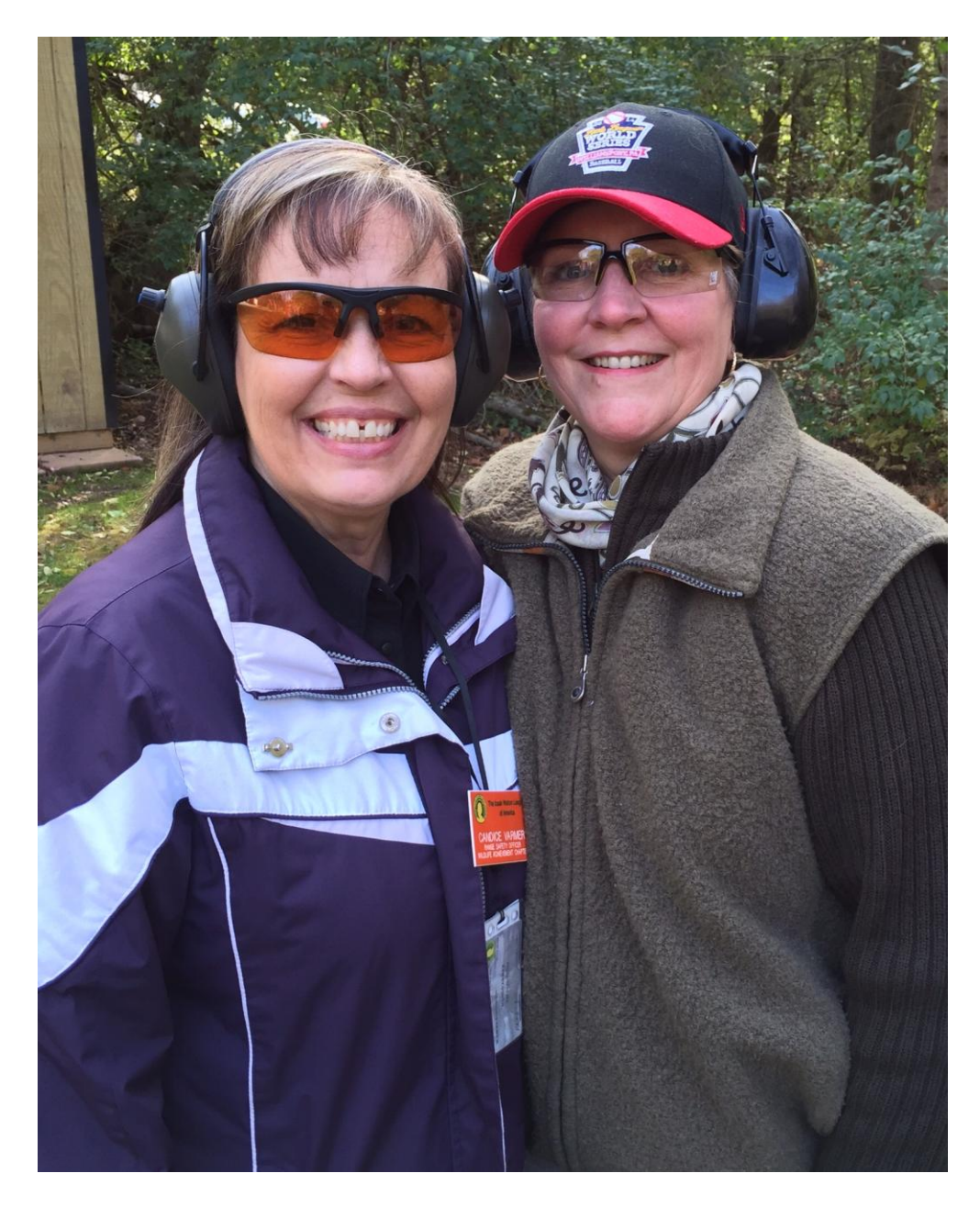
Participants in Basic Rifle Class march 11, 2017