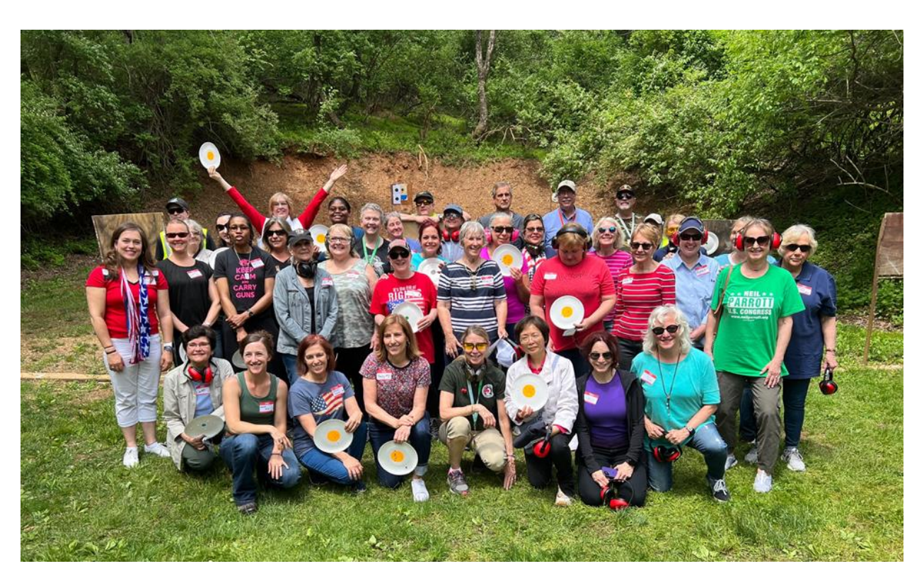
Girls & Guns held their last event on Sunday, May 15. Good times were had by all. Next event is Saturday, August 20.

For more information on this rule, go to: https://www.justice.gov/opa/press-release/file/1493431/download